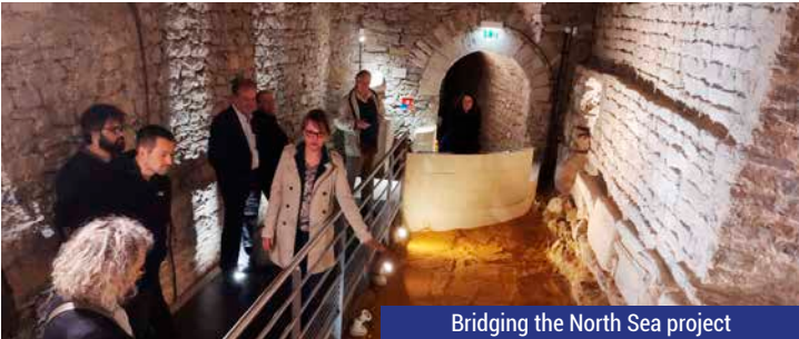
Bridging the North Sea project