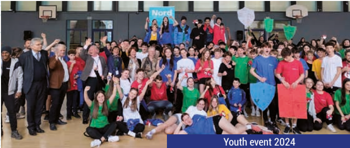
Youth event 2024